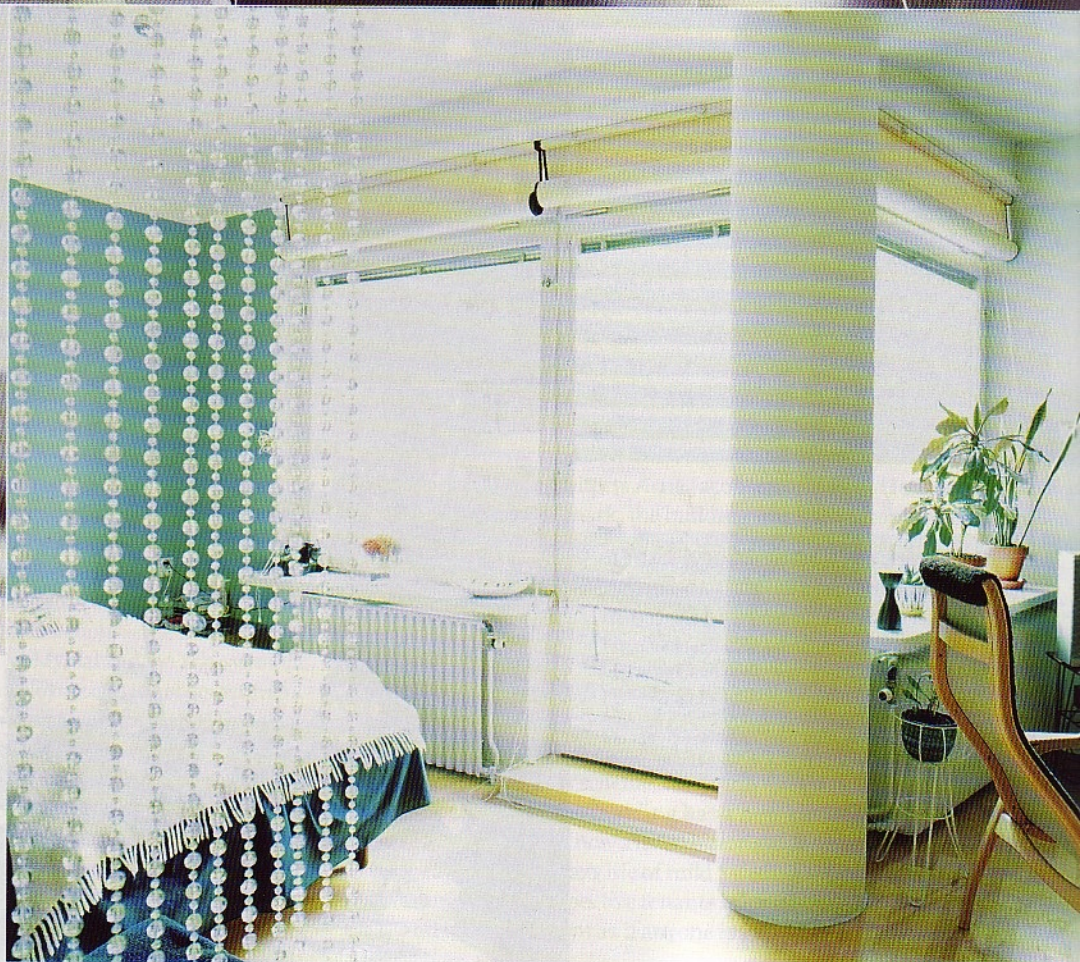
BEAD THERE, DONE THAT: single write female. Clockwise from top left, Hammacher leans out. Closet space and view into the bedroom. The bedroom and view of the balcony. Cactus and pot.