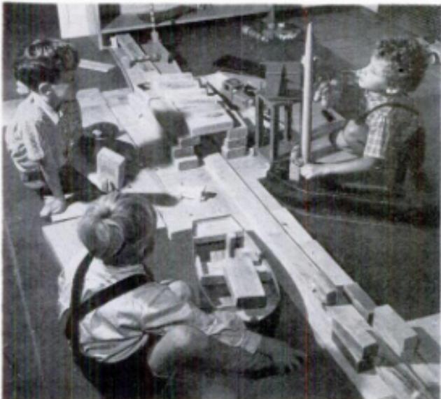
Combination nursery-kindergarten is bountifully supplied with toys, is in charge of trained nurses. It is always open. Charges are about $1 per day per child with meals.