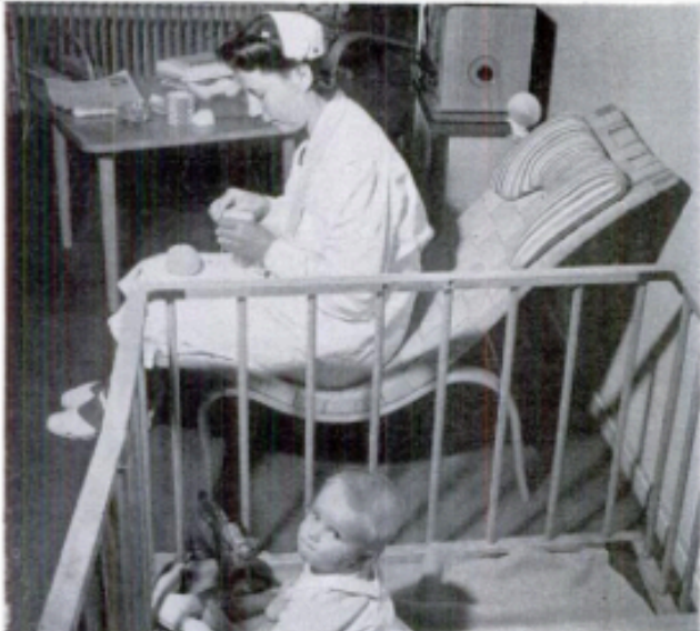
Baby sitters, members of the apartment-house staff, are always available to spend the day with children while father and mother are at work. Building has 80 occupants.