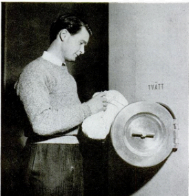
Chutes lead from each floor to basement laundry operated by Kollektivhuset. Tenants hold monthly meetings, discuss efficiency of services, suggest improvements.