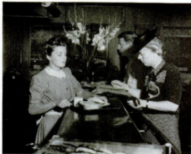
Cafeteria on the ground floor serves meals to tenants as well as to general public. Dinner costs 50¢. Kollektivhuset is proud of its low divorce rate: two cases in ten years.