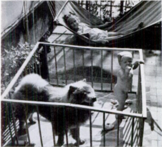
On apartment balcony children play in sun, parents grow flowers. Kollektivhuset was privately financed. Tenants now buy shares, own and run the building cooperatively.