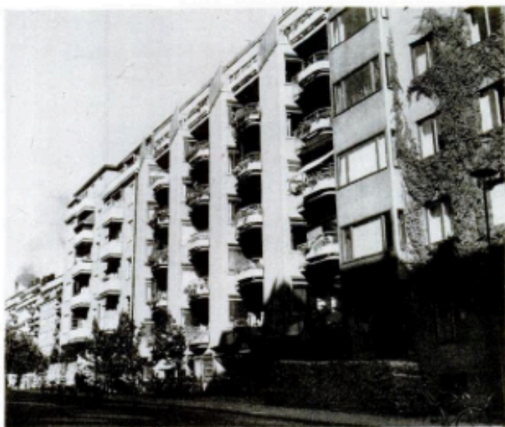
FRONT OF KOLLEKTIVHUSET ALSO HAS BALCONIES, ONE FOR EACH OF THE APARTMENTS